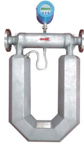
Shanghai YINUO's Model LZYNU Coriolis flowmeter is available in line sizes up to 8 inches (DN200).