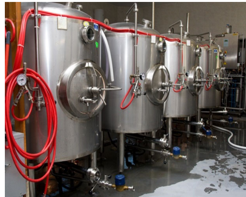
Beverage processing plant production line